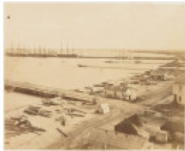
1858, Railway Pier.jpg