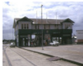
station pier entrance building march 1993