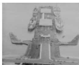
1930s, Aerial view.jpg