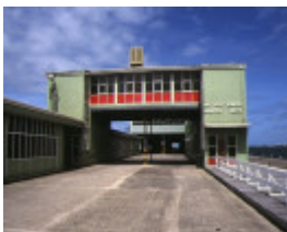
station pier port melbourne port workers amenities block