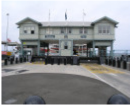
STATION PIER, 2008