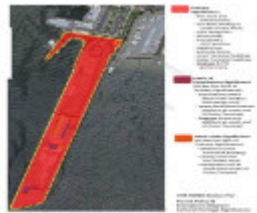
Permit Policy and exemption plan 2019