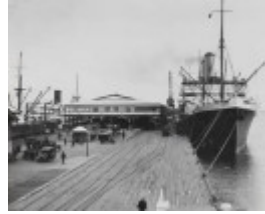
1930s, Passenger ship at Station Pier.jpg