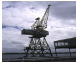
station pier port melbourne loading equipment