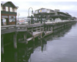
1 station pier port melbourne side view of pier