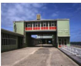
station pier port melbourne port workers amenities block