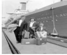
1958, Migrants arriving on Station Pier.jpg