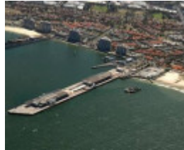
2018, Aerial view.jpg