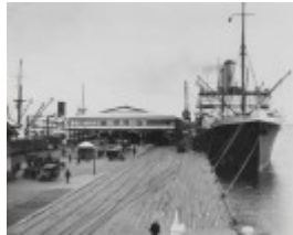
1930s, Passenger ship at Station Pier.jpg