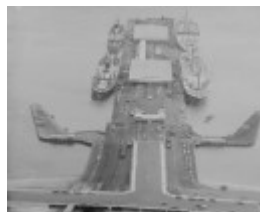
1930s, Aerial view.jpg