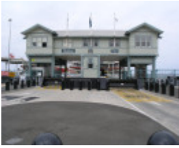
STATION PIER, 2008