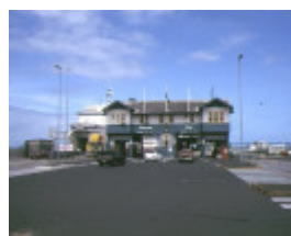
station pier approach view march 1993