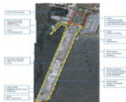
Amendment Diagram 2019