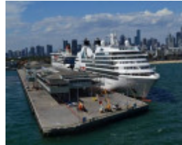
2018, Looking North.jpg