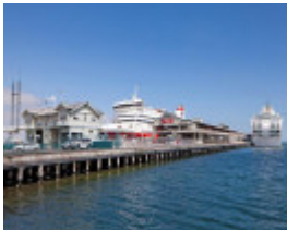
2018, Looking South-east.jpg