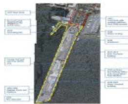
Amendment Diagram 2019