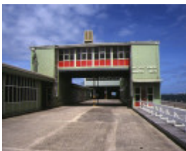
station pier port melbourne port workers amenities block