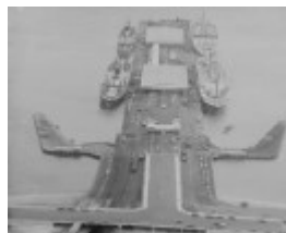
1930s, Aerial view.jpg