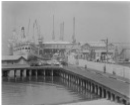
1930s, Entrance to Station Pier.jpg