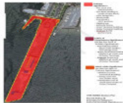
Permit Policy and exemption plan 2019