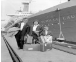
1958, Migrants arriving on Station Pier.jpg