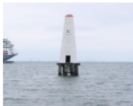
LEADING LIGHTS SOHE 2008