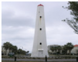
LEADING LIGHTS SOHE 2008