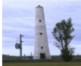
1 leading lights beach road port melbourne view of inner leading light