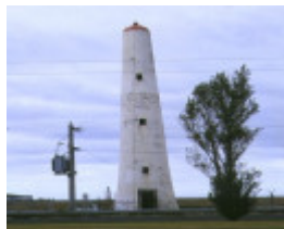
1 leading lights beach road port melbourne view of inner leading light