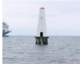
LEADING LIGHTS SOHE 2008