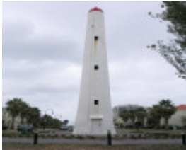
LEADING LIGHTS SOHE 2008