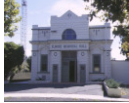
1 the athenaeum & memorial hall michie street elmore memorial front view apr1998