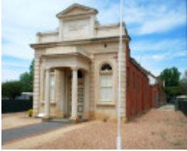
THE ATHENAEUM AND MEMORIAL HALL SOHE 2008