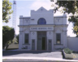
1 the athenaeum & memorial hall michie street elmore memorial front view apr1998