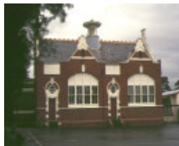
1 primary school number 734 dandenong road clayton front view