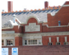
PRIMARY SCHOOL NO. 734 SOHE 2008