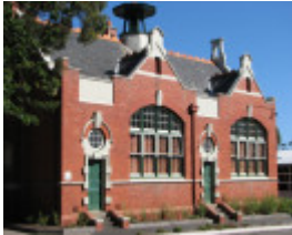
PRIMARY SCHOOL NO. 734 SOHE 2008