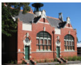
PRIMARY SCHOOL NO. 734 SOHE 2008