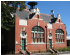
PRIMARY SCHOOL NO. 734 SOHE 2008