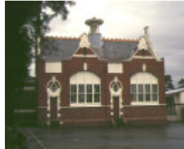
1 primary school number 734 dandenong road clayton front view