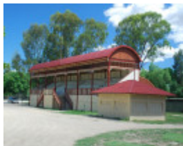
GRANDSTAND SOHE 2008