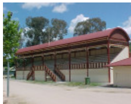
1 grandstand benalla front view nov99