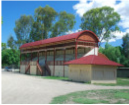
GRANDSTAND SOHE 2008