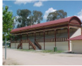
1 grandstand benalla front view nov99