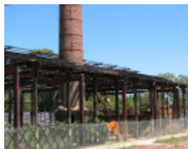
WUNDERLICH/MONIER TERRACOTTA ROOF TILES COMPLEX SOHE 2008