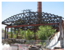
WUNDERLICH/MONIER TERRACOTTA ROOF TILES COMPLEX SOHE 2008