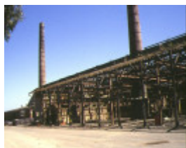
1 wunderlich terra cotta tile works demolished mitcham road vermont view of chimneys nov1993