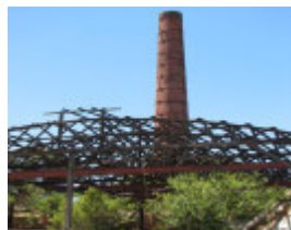
WUNDERLICH/MONIER TERRACOTTA ROOF TILES COMPLEX SOHE 2008