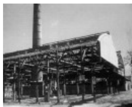
1 wunderlich terra cotta tile works demolished mitcham road vermont view structure