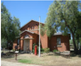
FORMER PLEASANT CREEK COURT HOUSE SOHE 2008