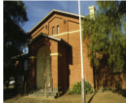
1 flormer pleasant creek court house longfield street stawell front view