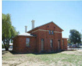
FORMER PLEASANT CREEK COURT HOUSE SOHE 2008