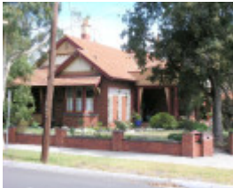
FORMER DEPUTY MANAGER'S RESIDENCE, NEWPORT RAILWAY WORKSHOPS SOHE 2008