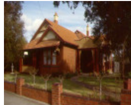
1 59 champion rd williamstown pm2 aug1999