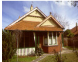
1 57 champion rd williamstown pm2 aug1999