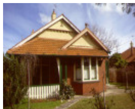
1 57 champion rd williamstown pm2 aug1999