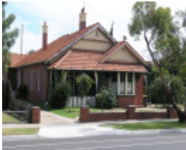
FORMER MANAGER'S RESIDENCE, NEWPORT RAILWAY WORKSHOPS SOHE 2008