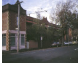
1 dorothy terrace 34 lulie street abbotsford front detail