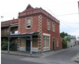
DOROTHY TERRACE SOHE 2008