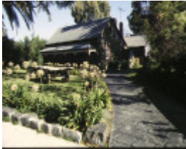
1 siebels farmhouse mount view road thomastown front view