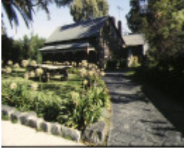
1 siebels farmhouse mount view road thomastown front view