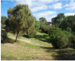
COLLINS SETTLEMENT SITE SOHE 2008