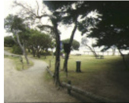
1 collins settlement site nepean hwy sorrento foreshore reserve dec1996