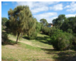
COLLINS SETTLEMENT SITE SOHE 2008