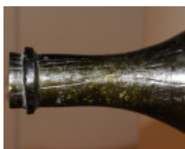
Collins Settlement Site bottle, view of the neck and lip