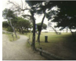
1 collins settlement site nepean hwy sorrento foreshore reserve dec1996