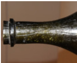
Collins Settlement Site bottle, view of the neck and lip