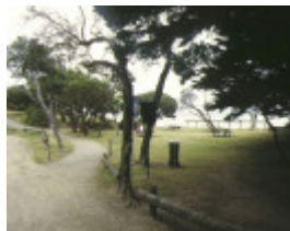
1 collins settlement site nepean hwy sorrento foreshore reserve dec1996