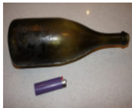
Collins Settlement Site bottle