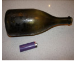
Collins Settlement Site bottle