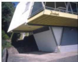
h01906 mccraith house atunga terrace dromana front carport she project 2003