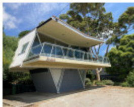
Butterfly House Jan 2023