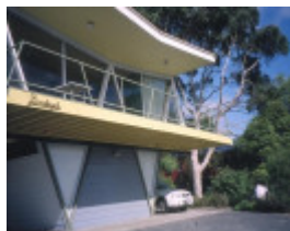
h01906 mccraith house atunga terrace dromana front view she project 2003