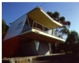
McCraith House Atunga