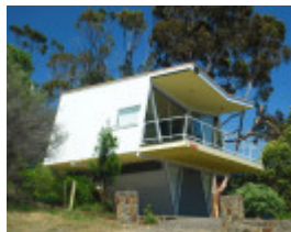
MCCRAITH HOUSE SOHE 2008