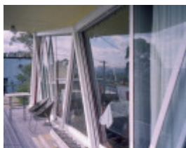
h01906 mccraith house atunga terrace dromana verandah she project 2003