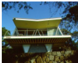
1 atunga terrace, elevation