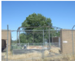
HAMILTON GAS HOLDER SOHE 2008