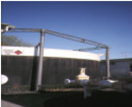
1 hamilton gas holder craig street hamilton gas holder