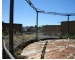
HAMILTON GAS HOLDER SOHE 2008