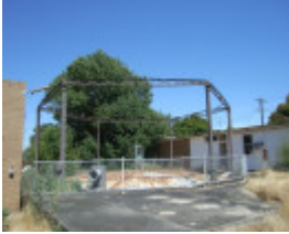
HAMILTON GAS HOLDER SOHE 2008