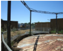
HAMILTON GAS HOLDER SOHE 2008