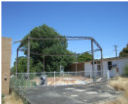
HAMILTON GAS HOLDER SOHE 2008