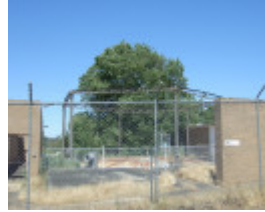
HAMILTON GAS HOLDER SOHE 2008