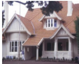
h01178 myrning cnr kent and macarthur st hamilton front view lshe project 2003