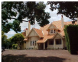
H01178 1 myrniong front feb2003