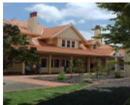
H01178 myrniong back2 feb2003