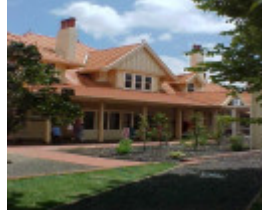
H01178 myrning back2 feb2003