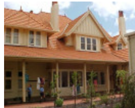
H01178 myrning back feb2003