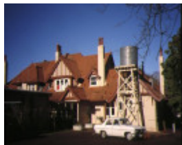
H01178 myrniong hensley park road hamilton front view aug1994