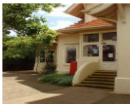
H01178 myrniong side2 feb2003