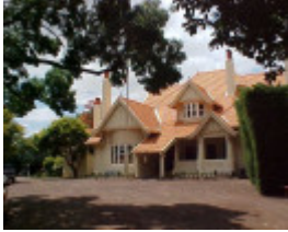
H01178 1 myrning front feb2003