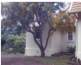
h01178 myrning cnr kent and macarthur st hamilton rear roof line she project 2003