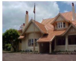
H01178 myrning front2 feb2003