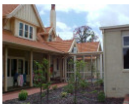
H01178 myrniong feb2003