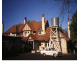
H01178 myrning hensley park road hamilton front view aug1994