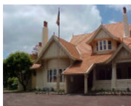
H01178 myrniong front2 feb2003