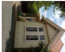
H01178 myrning side feb2003