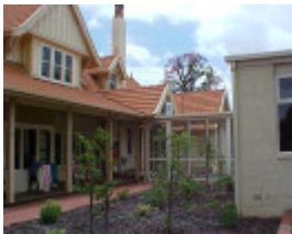
H01178 myrning feb2003