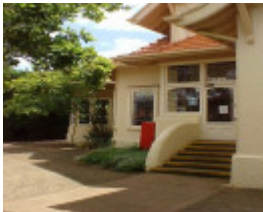
H01178 myrning side2 feb2003