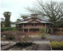
1 state nursery office creswick front view sep1989