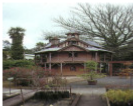
1 state nursery office creswick front view sep1989