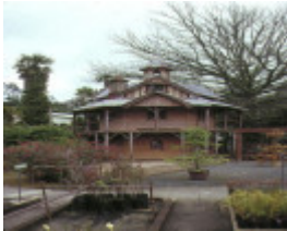
1 state nursery office creswick front view sep1989