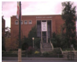
1 bendigo art gallery view street bendigo front entrance