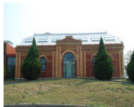
BENDIGO ART GALLERY SOHE 2008