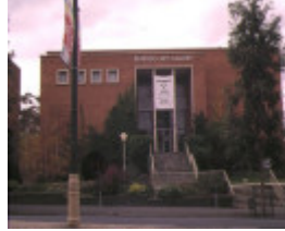
1 bendigo art gallery view street bendigo front entrance