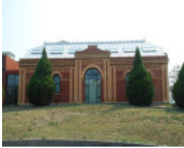
BENDIGO ART GALLERY SOHE 2008