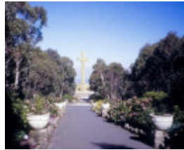
h01027 macedon cross cameron drive mt macedon cross she project 2003