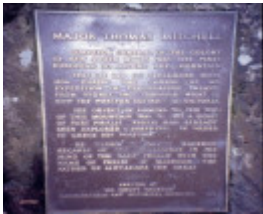
h01027 macedon cross cameron drive mt macedon plaque she project 2003