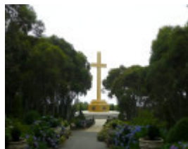
MACEDON CROSS SOHE 2008