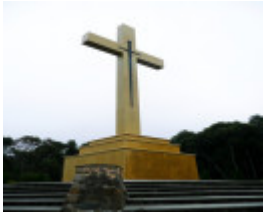
MACEDON CROSS SOHE 2008