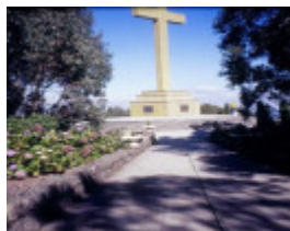
h01027 1 macedon cross cameron drive mt macedon approach she project 2003