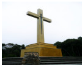
MACEDON CROSS SOHE 2008