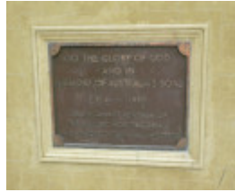
MACEDON CROSS SOHE 2008