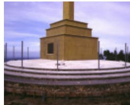
h01027 cameron memorial cross cameron drive mount macedon cross base