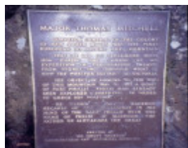
h01027 macedon cross cameron drive mt macedon plaque she project 2003