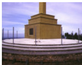
h01027 cameron memorial cross cameron drive mount macedon cross base