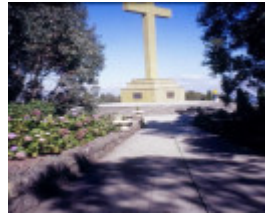
h01027 1 macedon cross cameron drive mt macedon approach she project 2003