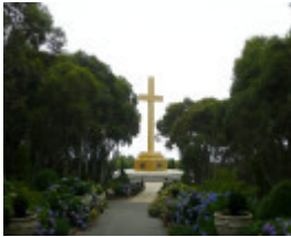
MACEDON CROSS SOHE 2008