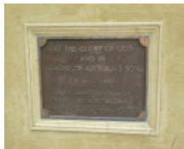
MACEDON CROSS SOHE 2008