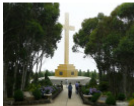
MACEDON CROSS SOHE 2008