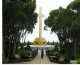
MACEDON CROSS SOHE 2008