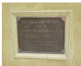
MACEDON CROSS SOHE 2008