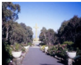
h01027 macedon cross cameron drive mt macedon cross she project 2003