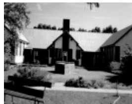
FORMER MURRAYVILLE CONSOLIDATED SCHOOL SOHE 2008