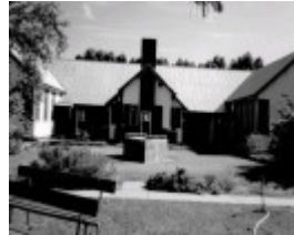
FORMER MURRAYVILLE CONSOLIDATED SCHOOL SOHE 2008