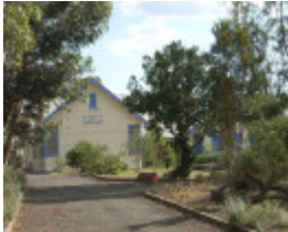
FORMER MURRAYVILLE CONSOLIDATED SCHOOL SOHE 2008