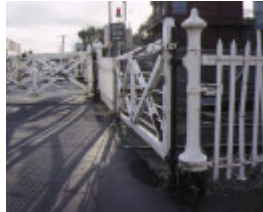
1 interlocked railway crossing gates anderson street yarraville closed interlocked gates apr1994