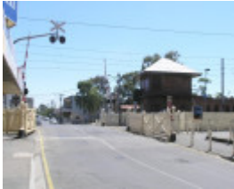
INTERLOCKING RAILWAY CROSSING GATES SOHE 2008