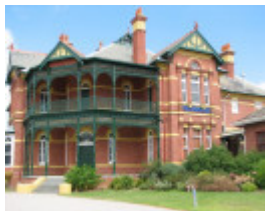
BUNDOORA PARK HOMESTEAD SOHE 2008