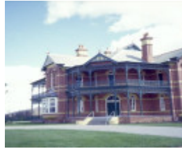
h01091 1 bundoor homestead snake gully drive bundoor close up homestead she project 2003