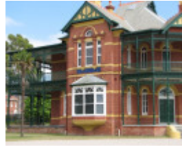
BUNDOORA PARK HOMESTEAD SOHE 2008