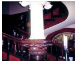
bundoor homestead snake gully drive bundoor staircase she project 2003