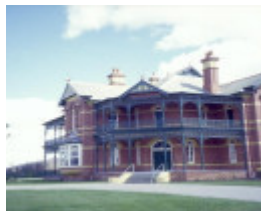
h01091 1 bundoor homestead snake gully drive bundoora close up homestead she project 2003