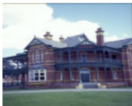
bundoora homestead snake gully drive bundoor exterior she project 2003