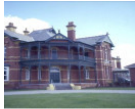
bundoor homestead snake gully drive bundoor facade she project 2003