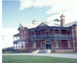
h01091 1 bundoor homestead snake gully drive bundoor close up homestead she project 2003