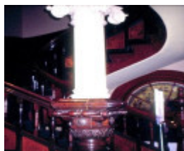
bundoora homestead snake gully drive bundoor staircase she project 2003