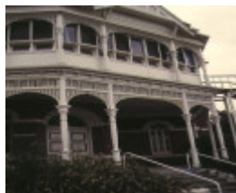
J V Smith Homestead Bundoora Entry February 1995