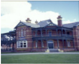
bundoor homestead snake gully drive bundoor exterior she project 2003