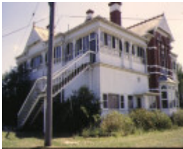
J V Smith Homestead Bundoor Side View January 1995