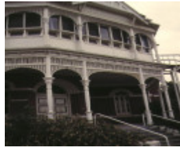
J V Smith Homestead Bundoor Entry February 1995