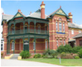
BUNDOORA PARK HOMESTEAD SOHE 2008