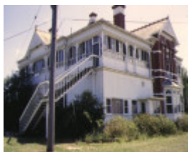
J V Smith Homestead Bundoora Side View January 1995