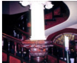
bundoor homestead snake gully drive bundoor staircase she project 2003