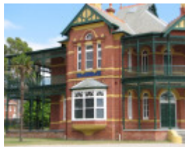
BUNDOORA PARK HOMESTEAD SOHE 2008