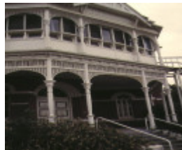
J V Smith Homestead Bundoor Entry February 1995