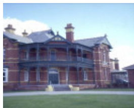
bundoora homestead snake gully drive bundoor facade she project 2003