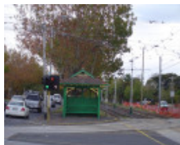
H0230 Tram shelter Dandenong Rd Caulfield May 2006 side view pj