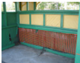
TRAM SHELTER SOHE 2008