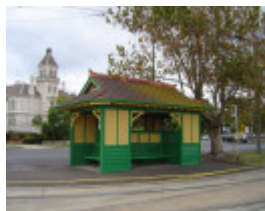
H0230 Tram shelter Dandenong Rd Caulfield May 2006 north east pj