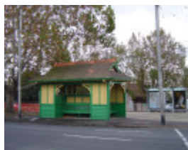
Tram Shelter Dandenong Rd Caulfield May 2006 South Side