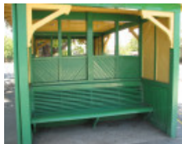
TRAM SHELTER SOHE 2008