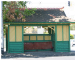
TRAM SHELTER SOHE 2008