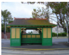
Tram Shelter Dandenong Rd Caulfield May 2006 North Side