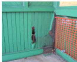
TRAM SHELTER SOHE 2008