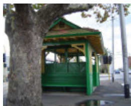
Tram Shelter Dandenong Rd Caulfield May 2006 West Side