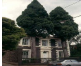
H00162 1 35 hanover street fitzroy