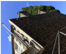
RESIDENCE October 2016