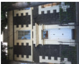
RESIDENCE October 2016