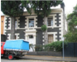
RESIDENCE SOHE 2008