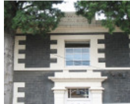
RESIDENCE SOHE 2008