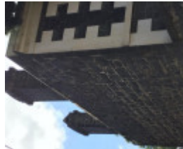
RESIDENCE October 2016