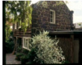
H00162 35 hanover street former stables