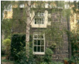
H00162 35 hanover street fitzroy kitchen block