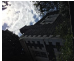
RESIDENCE October 2016