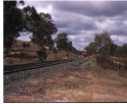
1 ravenwood railway siding view of lines 1994