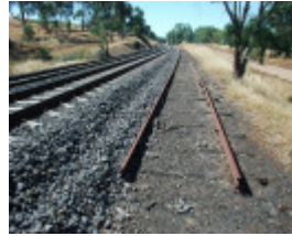
RAVENSWOOD RAILWAY SIDING SOHE 2008