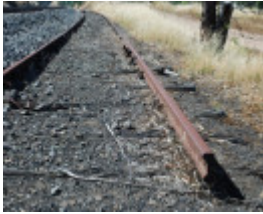
RAVENSWOOD RAILWAY SIDING SOHE 2008