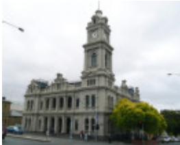
FORMER GEELONG POST OFFICE SOHE 2008