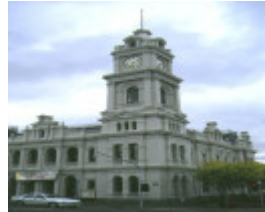
1 former geelong post office geelong clock tower apr1997