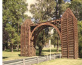
1 red gum memorial echuca front elevation