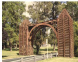
1 red gum memorial echuca front elevation