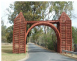
RED GUM MEMORIAL ARCHWAY SOHE 2008