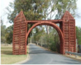
RED GUM MEMORIAL ARCHWAY SOHE 2008