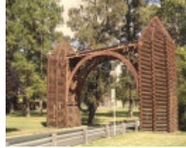
1 red gum memorial echuca front elevation