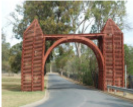
RED GUM MEMORIAL ARCHWAY SOHE 2008