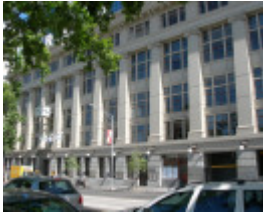
THE HERALD & WEEKLY TIMES BUILDING SOHE 2008