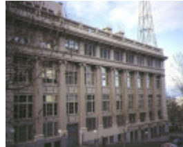
1 the herald & weekly times building flinders street melbourne front view aug1995