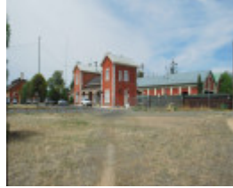
ECHUCA RAILWAY STATION COMPLEX SOHE 2008