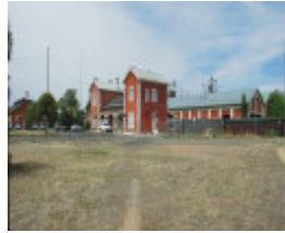
ECHUCA RAILWAY STATION COMPLEX SOHE 2008