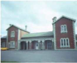
1 echuca railway station complex front entrance jul1984