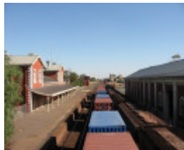
Echuca RWS Complex from North February 2002.