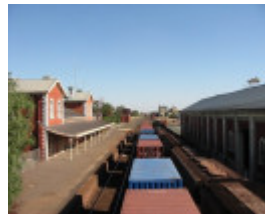
Echuca RWS Complex from North February 2002.