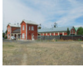
ECHUCA RAILWAY STATION COMPLEX SOHE 2008