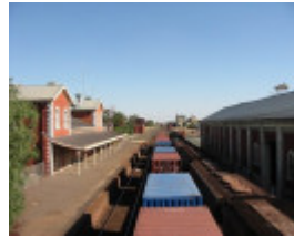
Echuca RWS Complex from North February 2002.