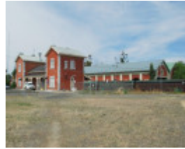
ECHUCA RAILWAY STATION COMPLEX SOHE 2008