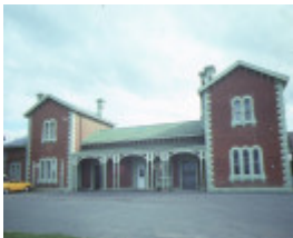
1 echuca railway station complex front entrance jul1984