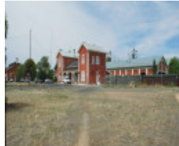
ECHUCA RAILWAY STATION COMPLEX SOHE 2008