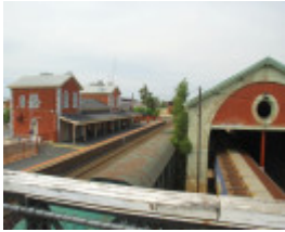
ECHUCA RAILWAY STATION COMPLEX SOHE 2008