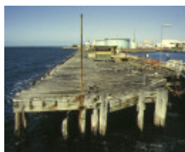
1 gellibrand pier & breakwater pier point gellibrand williamstown breakwater pier dec1994