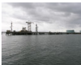
GELLIBRAND PIER AND BREAKWATER PIER SOHE 2008