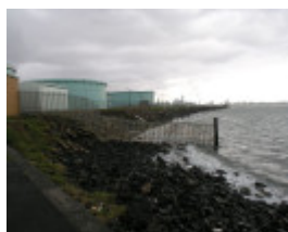
GELLIBRAND PIER AND BREAKWATER PIER SOHE 2008