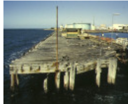
1 gellibrand pier & breakwater pier point gellibrand williamstown breakwater pier dec1994