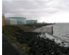
GELLIBRAND PIER AND BREAKWATER PIER SOHE 2008