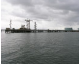
GELLIBRAND PIER AND BREAKWATER PIER SOHE 2008