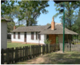
LA TROBE'S COTTAGE SOHE 2008