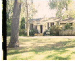
1 la trobe cottage 162 birdwood avenue south yarra front view