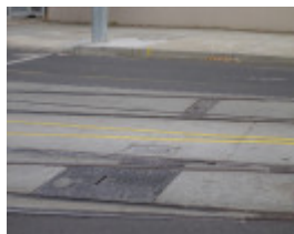
Grand Union Junction Caulfield Rails April 2006