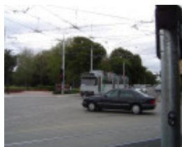
Grand Union Junction Caulfield April 2006