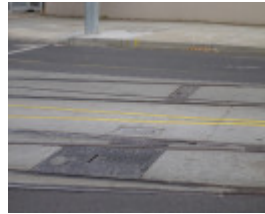
Grand Union Junction Caulfield Rails April 2006