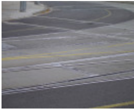
Grand Union Junction Caulfield Rails April 2006