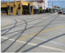
GRAND UNION TRAMWAY JUNCTION SOHE 2008