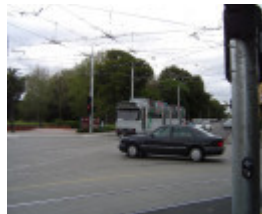
Grand Union Junction Caulfield April 2006