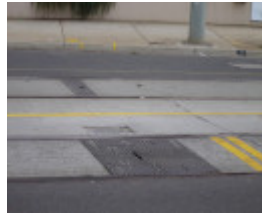
Grand Union Junction Caulfield Rails April 2006