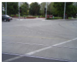
Grand Union Junction Caulfield Rails April 2006