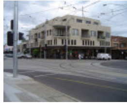
4732 Grand Union Junction Caulfield 2644