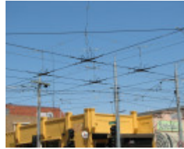
GRAND UNION TRAMWAY JUNCTION SOHE 2008