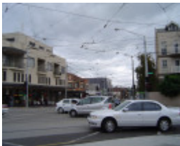
Grand Union Junction Caulfield overhead wires April 2006