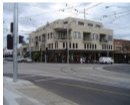
4732 Grand Union Junction Caulfield 2644