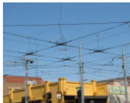
GRAND UNION TRAMWAY JUNCTION SOHE 2008