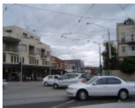
Grand Union Junction Caulfield overhead wires April 2006