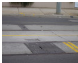
Grand Union Junction Caulfield Rails April 2006