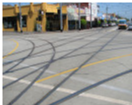
GRAND UNION TRAMWAY JUNCTION SOHE 2008