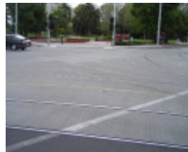
Grand Union Junction Caulfield Rails April 2006