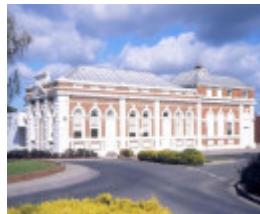
east gippsland regional library service street bairnsdale nicholson st side she project 2003