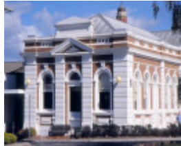
h01284 1 east gippsland regional library service street bairnsdale main entrance she project 2003