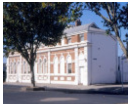
east gippsland regional library service street bairnsdale nicholson st side and rear she project 2003