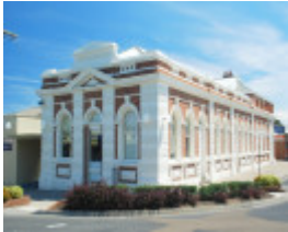
EAST GIPPSLAND SHIRE LIBRARY (FORMER BAIRNSDALE MECHANICS INSTITUTE) SOHE 2008