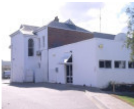
east gippsland regional library service street bairnsdale new extension at rear she project 2003