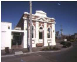
h01284 bairnsdale mechanics institute front view