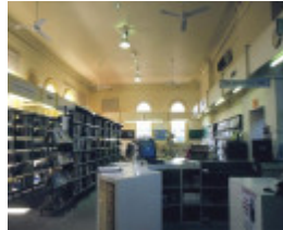
east gippsland regional library service street bairnsdale interior she project 2003