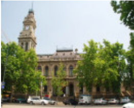
BENDIGO POST OFFICE SOHE 2008