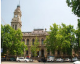
BENDIGO POST OFFICE SOHE 2008