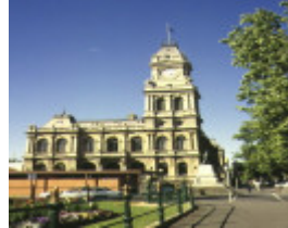
1 bendigo post office front view