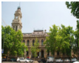
BENDIGO POST OFFICE SOHE 2008