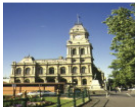
1 bendigo post office front view