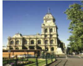
1 bendigo post office front view