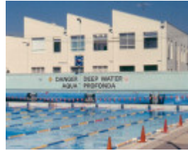
h01687 aqua profunda sign fitzroy pool