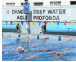
"AQUA PROFONDA" SIGN, FITZROY POOL SOHE 2008