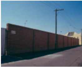
h01687 fitzroy pool wall