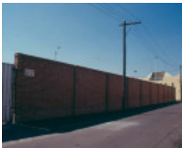
h01687 fitzroy pool wall