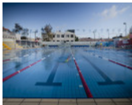
Aqua Profonda Sign, Fitzroy Pool