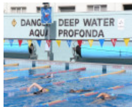
"AQUA PROFONDA" SIGN, FITZROY POOL SOHE 2008