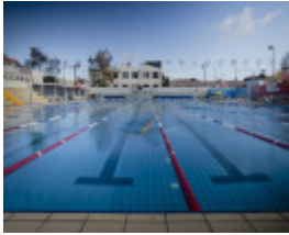
Aqua Profonda Sign, Fitzroy Pool