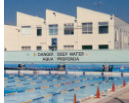
h01687 aqua profunda sign fitzroy pool