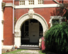
CESTRIA SOHE 2008