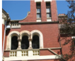
CESTRIA SOHE 2008