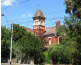
CESTRIA SOHE 2008