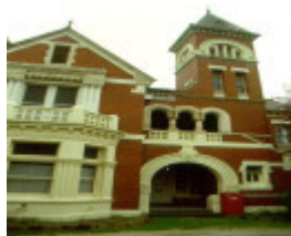
1 cestria h1924 2000