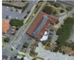
H0983 air photo 21-11- 2017.JPG