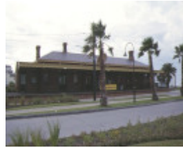
1 railway station complex beach road port melbourne front elevation mar1999