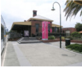
PORT MELBOURNE RAILWAY STATION SOHE 2008