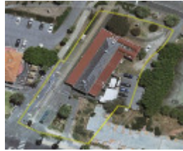
H0983 air photo 21-11- 2017.JPG