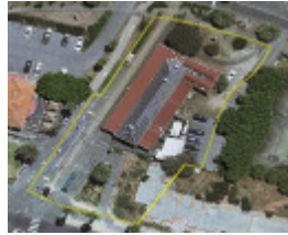
H0983 air photo 21-11- 2017.JPG