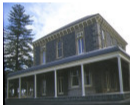
1 osborne house geelong front view of house apr1997