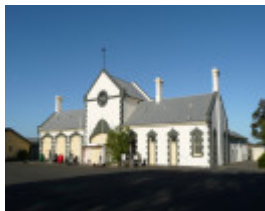
OSBORNE HOUSE SOHE 2008