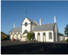
OSBORNE HOUSE SOHE 2008