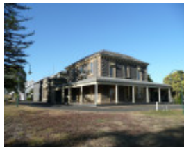
OSBORNE HOUSE SOHE 2008