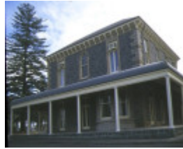
1 osborne house geelong front view of house apr1997