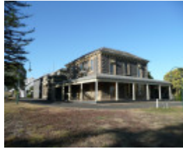
OSBORNE HOUSE SOHE 2008