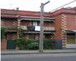
DOROTHY TERRACE SOHE 2008