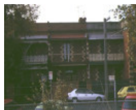
1 dorothy terrace 36 lulie street abbotsford front view