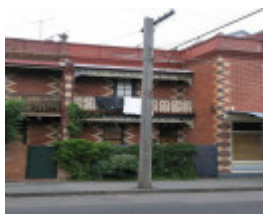
DOROTHY TERRACE SOHE 2008