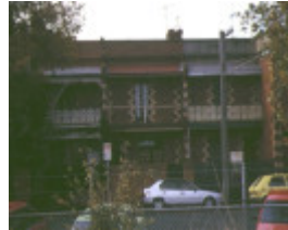
1 dorothy terrace 36 lulie street abbotsford front view