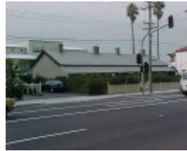
Iron Cottage 181 Brunswick Road Brunswick