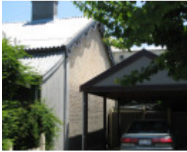
IRON COTTAGE SOHE 2008