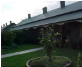
Iron Cottage 181 Brunswick Road Brunswick