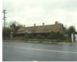
1 iron cottage brunswick road brunswick housing row 1992