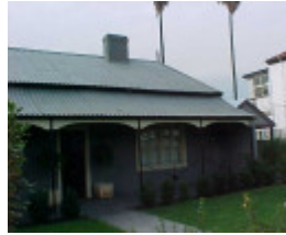
Iron Cottage 181 Brunswick Road Brunswick