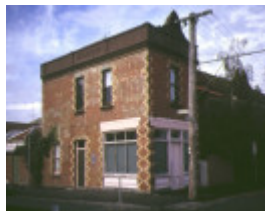
1 dorothy terrace 48 lulie street abbotsford rear-view