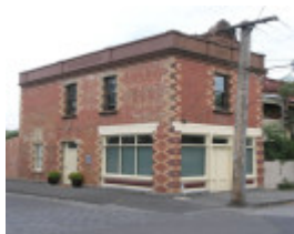
DOROTHY TERRACE SOHE 2008