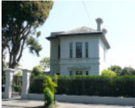
MILTON HOUSE SOHE 2008