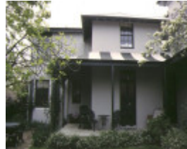
1 milton house aphrasia street geelong verandah