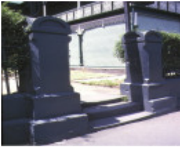
osborne house nicholson street fitzroy gates jan1979