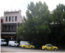
OSBORNE HOUSE SOHE 2008