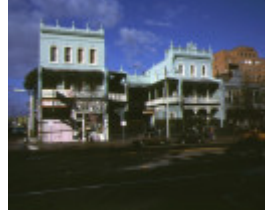
osborne house nicholson street fitzroy front view jun1979