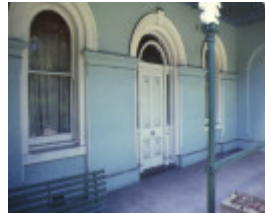
osborne house nicholson street fitzroy verandah jan1979