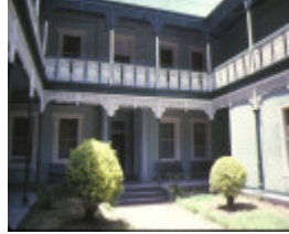
1 osborne house nicholson street fitzroy entrance view jan1978