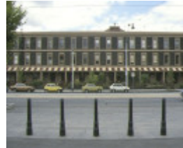
1 royal terrace nicholson street fitzroy front elevation feb1986