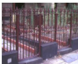
royal terrace nicholson street fitzroy front cast iron fence mar1982