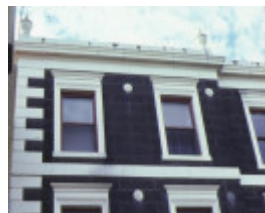
royal terrace nicholson street fitzroy front window detail aug1980