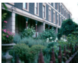
Royal Terrace Nicholson Street Fitzroy Front Elevation South 1998