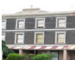
ROYAL TERRACE SOHE 2008