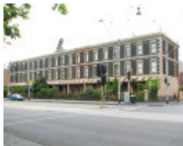
ROYAL TERRACE SOHE 2008