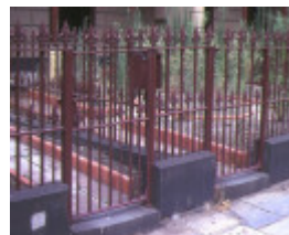
royal terrace nicholson street fitzroy front cast iron fence mar1982