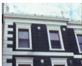
royal terrace nicholson street fitzroy front window detail aug1980