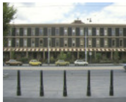
1 royal terrace nicholson street fitzroy front elevation feb1986