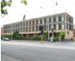
ROYAL TERRACE SOHE 2008