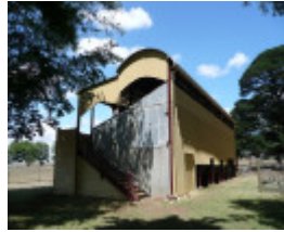
KINGSTON GRANDSTAND SOHE 2008