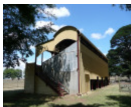
KINGSTON GRANDSTAND SOHE 2008