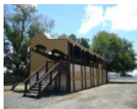
KINGSTON GRANDSTAND SOHE 2008