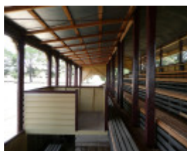
KINGSTON GRANDSTAND SOHE 2008