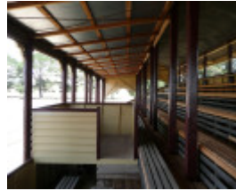
KINGSTON GRANDSTAND SOHE 2008