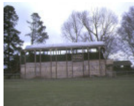
1 kingston grandstand kingston allendale road kingston front view jul1987