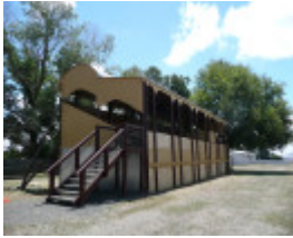
KINGSTON GRANDSTAND SOHE 2008