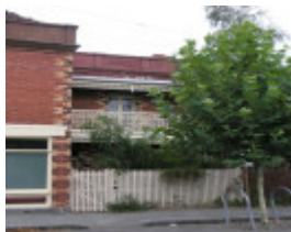
DOROTHY TERRACE SOHE 2008