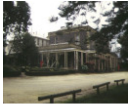
1 morongo bell post hill additions to south side of house