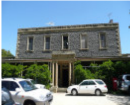
MORONGO PRIVATE BOARDING SCHOOL SOHE 2008