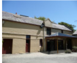
MORONGO PRIVATE BOARDING SCHOOL SOHE 2008