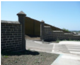
MORONGO PRIVATE BOARDING SCHOOL SOHE 2008