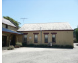
MORONGO PRIVATE BOARDING SCHOOL SOHE 2008