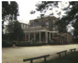
1 morongo bell post hill additions to south side of house