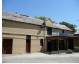
MORONGO PRIVATE BOARDING SCHOOL SOHE 2008