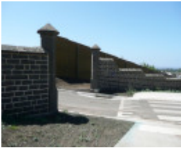
MORONGO PRIVATE BOARDING SCHOOL SOHE 2008