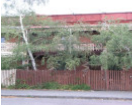
DOROTHY TERRACE SOHE 2008