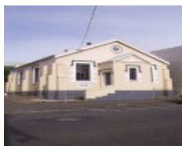
1 mt zion particular baptist church geelong front view apr1997