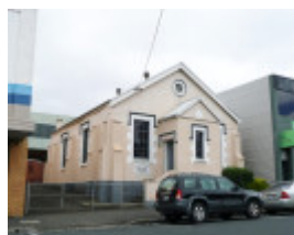
MT ZION PARTICULAR BAPTIST CHURCH SOHE 2008