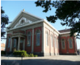
ST MARYS HALL SOHE 2008