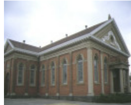
1 st mary's hall geelong side elevation apr1997