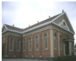
1 st mary's hall geelong side elevation apr1997