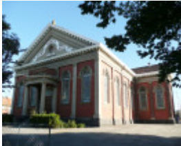
ST MARYS HALL SOHE 2008