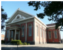
ST MARYS HALL SOHE 2008