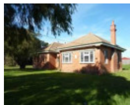
2013 Former Cunningham Memorial Hall and Library .jpg