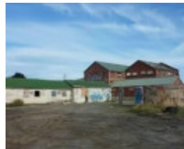
2013 Amenities building, main building and tanks from north east.jpg