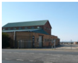
CHEETHAM SALTWORKS SOHE 2008