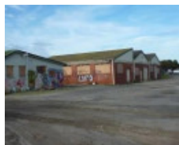
2013 Workshop building.jpg