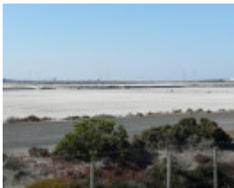
CHEETHAM SALTWORKS SOHE 2008