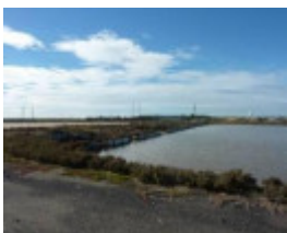
2013 Crystalliser pan.jpg