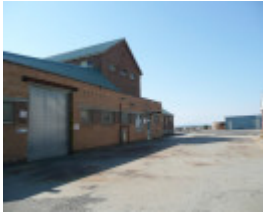
CHEETHAM SALTWORKS SOHE 2008