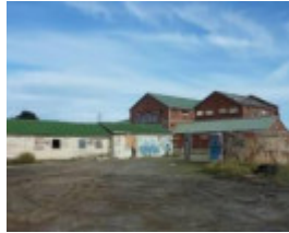
2013 Amenities building, main building and tanks from north east.jpg