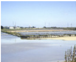
1 cheetham saltworks portarlinton road moolap crystallisers nov1995