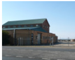
CHEETHAM SALTWORKS SOHE 2008