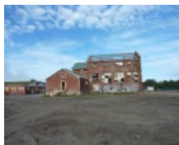
2013 Main building from north.jpg