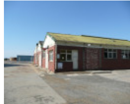
CHEETHAM SALTWORKS SOHE 2008