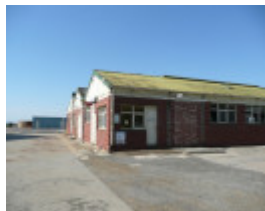
CHEETHAM SALTWORKS SOHE 2008