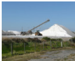
CHEETHAM SALTWORKS SOHE 2008