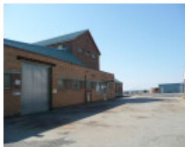
CHEETHAM SALTWORKS SOHE 2008