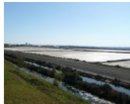
CHEETHAM SALTWORKS SOHE 2008