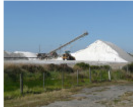
CHEETHAM SALTWORKS SOHE 2008