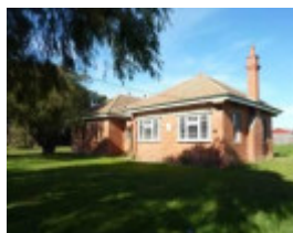
2013 Former Cunningham Memorial Hall and Library .jpg