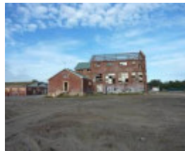
2013 Main building from north.jpg