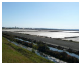
CHEETHAM SALTWORKS SOHE 2008