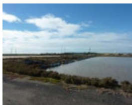
2013 Crystalliser pan.jpg