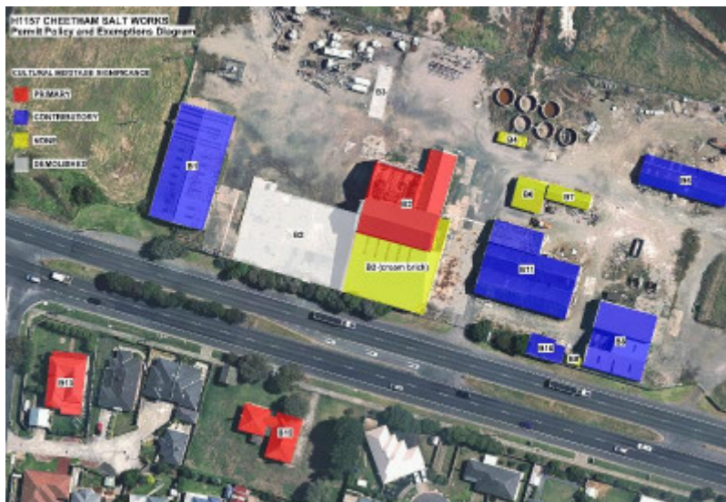
cheetham permit policy & exemptions diagram.JPG